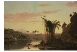
Title: Summer in South America Date: c. 1853 Primary Maker: Frederic Edwin Church Medium: Oil on board Object number: 1864.1.18 Credit Line: Gift of Matthew Vassar