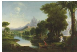
Title: Voyage of Life: Youth Date: Nd Primary Maker: James Smillie Medium: Oil on canvas Object number: X.153 Credit Line: Gift from the estate of Matthew Vassar