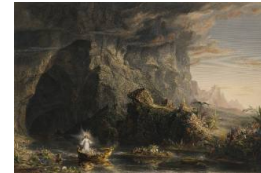
Title: The Voyage of Life - Childhood Date: 1855 Primary Maker: James Smillie Medium: Etching and engraving with watercolor and gouache (hand coloring) Object number: X.37