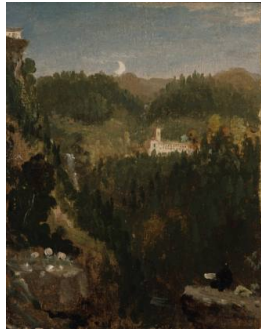
Title: Autumn Eve at Vallombrosa Date: c. 1831 Primary Maker: Thomas Cole Medium: Oil on board Object number: 1864.1.19 Credit Line: Gift of Matthew Vassar