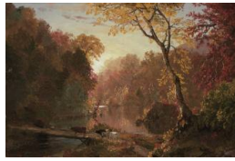
Title: Autumn in North America Date: c. 1856 Primary Maker: Frederic Edwin Church Medium: Oil on board Object number: 1864.1.16 Credit Line: Gift of Matthew Vassar