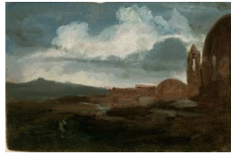
Title: Medieval Buildings, Sicily Date: c. 1842 Primary Maker: Thomas Cole Medium: Oil on panel Object number: 1993.15 Credit Line: Gift of Constance Wilckes Dohrenwend, class of 1928