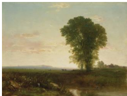
Title: Evening in the Meadows Date: c. 1853 Primary Maker: George Inness Medium: Oil on millboard, mounted to plexiglass Object number: 1864.1.47 Credit Line: Gift of Matthew Vassar