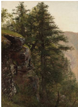
Title: Rocks and Pines Date: c. 1863/64 Primary Maker: Worthington Whittredge Medium: Oil on canvas Object number: 1935.4 Credit Line: Gift of Helen Corbett, class of 1932