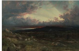
Title: Sunset on Mote Mountain Date: Nd Primary Maker: Aaron Draper Shattuck Medium: Oil on canvas Object number: 1864.1.67 Credit Line: Gift of Matthew Vassar