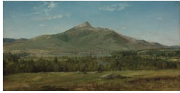
Title: Chocorua Lake and Mountain Date: 1855 Primary Maker: Aaron Draper Shattuck Medium: Oil on canvas Object number: 1864.1.64 Credit Line: Gift of Matthew Vassar