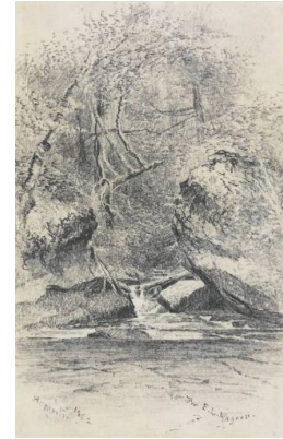
Title: Beaver Brook, White Mountains Date: 1862 Primary Maker: Homer Dodge Martin Medium: Pencil and white wash Object number: 1864.1.165 Credit Line: Gift of Matthew Vassar