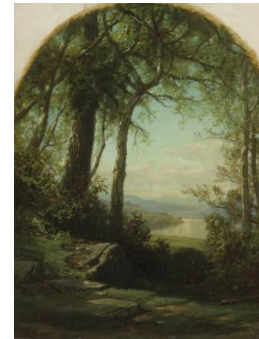
Title: A Glimpse of Lake Mahkunac Date: 1869 Primary Maker: James David Smillie Medium: Oil on canvas Object number: X.134