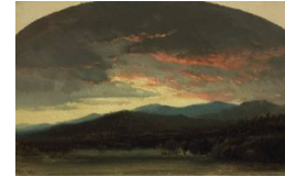
Title: Sunset at Lancaster, New Hampshire Date: 1859 Primary Maker: Aaron Draper Shattuck Medium: Oil on canvas Object number: 1864.1.66 Credit Line: Gift of Matthew Vassar