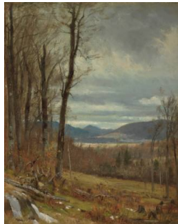
Title: Cold November Date: Nd Primary Maker: Worthington Whittredge Medium: Oil on paper, mounted on masonite Object number: 1995.4.2 Credit Line: Gift of Ruth Scherm, class of 1945