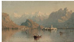
Title: Lago Maggiore Date: 1854 Primary Maker: Sanford Robinson Gifford Medium: Oil on canvas Object number: 1864.1.33 Credit Line: Gift of Matthew Vassar