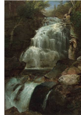
Title: Crystal Cascade Date: Nd Primary Maker: Homer Dodge Martin Medium: Oil on canvas Object number: 1864.1.54 Credit Line: Gift of Matthew Vassar