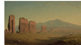
Title: The Roman Campagna Date: 1859 Primary Maker: Sanford Robinson Gifford Medium: Oil on canvas Object number: 1864.1.34 Credit Line: Gift of Matthew Vassar