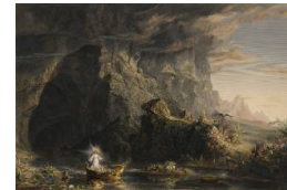
Title: The Voyage of Life - Childhood Date: 1855 Primary Maker: James Smillie Medium: Etching and engraving with watercolor and gouache (hand coloring) Object number: X.37