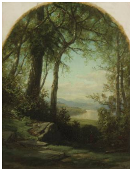
Title: A Glimpse of Lake Mahkunac Date: 1869 Primary Maker: James David Smillie Medium: Oil on canvas Object number: X.134