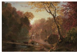
Title: Autumn in North America Date: c. 1856 Primary Maker: Frederic Edwin Church Medium: Oil on board Object number: 1864.1.16 Credit Line: Gift of Matthew Vassar