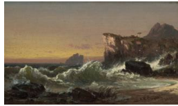
Title: Morning on the Coast of Sicily Date: 1855 Primary Maker: Jasper Francis Cropsey Medium: Oil on panel Object number: 1864.1.22 Credit Line: Gift of Matthew Vassar