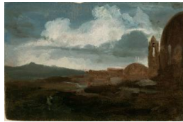
Title: Medieval Buildings, Sicily Date: c. 1842 Primary Maker: Thomas Cole Medium: Oil on panel Object number: 1993.15 Credit Line: Gift of Constance Wilckes Dohrenwend, class of 1928