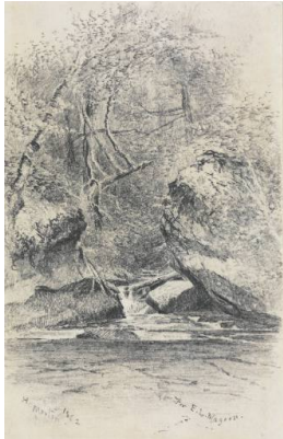
Title: Beaver Brook, White Mountains Date: 1862 Primary Maker: Homer Dodge Martin Medium: Pencil and white wash Object number: 1864.1.165 Credit Line: Gift of Matthew Vassar