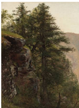
Title: Rocks and Pines Date: c. 1863/64 Primary Maker: Worthington Whittredge Medium: Oil on canvas Object number: 1935.4 Credit Line: Gift of Helen Corbett, class of 1932