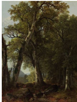
Title: Through the Woods Date: 1856 Primary Maker: Asher Brown Durand Medium: Oil on canvas Object number: 1864.1.25 Credit Line: Gift of Matthew Vassar