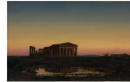
Title: Evening at Paestum Date: 1856 Primary Maker: Jasper Francis Cropsey Medium: Oil on panel Object number: 1864.1.21 Credit Line: Gift of Matthew Vassar