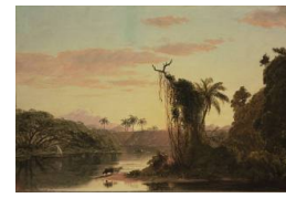
Title: Summer in South America Date: c. 1853 Primary Maker: Frederic Edwin Church Medium: Oil on board Object number: 1864.1.18 Credit Line: Gift of Matthew Vassar