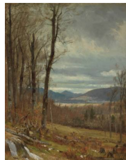
Title: Cold November Date: Nd Primary Maker: Worthington Whittredge Medium: Oil on paper, mounted on masonite Object number: 1995.4.2 Credit Line: Gift of Ruth Scherm, class of 1945