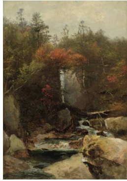
Title: Glen Ellis Falls Date: 1862 Primary Maker: Homer Dodge Martin Medium: Oil on canvas Object number: 1864.1.55 Credit Line: Gift of Matthew Vassar