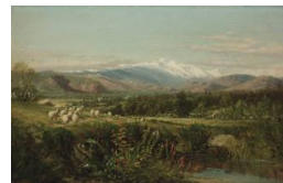
Title: Autumnal Snow on Mt. Washington Date: 1856 Primary Maker: Aaron Draper Shattuck Medium: Oil on canvas Object number: 1864.1.63 Credit Line: Gift of Matthew Vassar