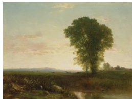
Title: Evening in the Meadows Date: c. 1853 Primary Maker: George Inness Medium: Oil on millboard, mounted to plexiglass Object number: 1864.1.47 Credit Line: Gift of Matthew Vassar