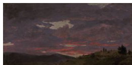
Title: Evening in Vermont Date: 1849 Primary Maker: Frederic Edwin Church Medium: Oil on board Object number: 1864.1.17 Credit Line: Gift of Matthew Vassar