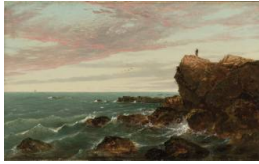
Title: Berkeley Rock, Newport Date: 1856 Primary Maker: John Frederick Kensett Medium: Oil on canvas Object number: 1864.1.49 Credit Line: Gift of Matthew Vassar