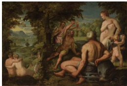
Title: Venus, Mercury, Vulcan, and Neptune in a Landscape Date: c. 1580 Primary Maker: Paolo Fiammingo Medium: Oil on canvas Object number: 1923.1.2 Credit Line: Museum purchase