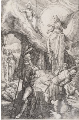
Title: The Resurrection Date: 1596 Primary Maker: Hendrick Goltzius Medium: Engraving Object number: 1969.21 Credit Line: Purchase, Adolf Katzenellenbogen Memorial Fund