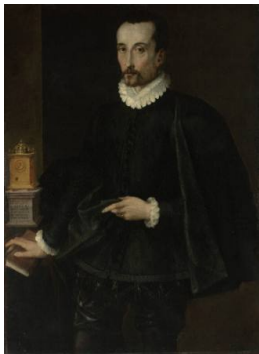
Title: Portrait of Niccolo Capponi Date: 1579 Primary Maker: Stradanus Medium: Oil on panel Object number: 1987.16 Credit Line: Gift of June Pilliod Torrey, class of 1939