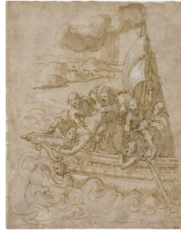
Title: Jonah Cast Over the Side of the Ship Date: Nd Primary Maker: Francesco Salviati Medium: Ink and wash over black chalk heightened with white on paper Object number: 1968.17 Credit Line: Purchase, Mary (Elizabeth) Weitzel Gibbons, class of 1951, Fund