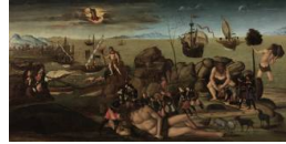
Title: The Adventures of Ulysses: The Blinding of Polyphemus Date: Early 1500s Primary Maker: The Master of the Johnson Assumption of the Magdalen Medium: Tempera on panel Object number: 1917.1.3.a Credit Line: Gift of Charles M. Pratt