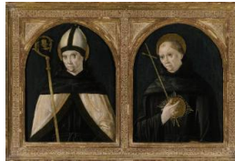
Title: Saints Augustine and Nicholas of Tolentino Date: c. 1496 Primary Maker: Boccaccio Boccaccino Medium: Tempera on panel Object number: 1917.1.1 Credit Line: Gift of Charles M. Pratt