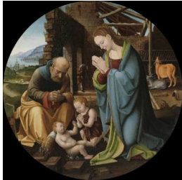
Title: Adoration of the Christ Child Date: c. 1500 Primary Maker: Master of the Campana Panels Medium: Tempera on panel Object number: 1917.1.5 Credit Line: Gift of Charles M. Pratt