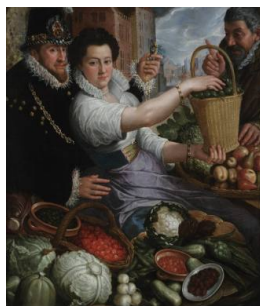
Title: Francois de Granvelle, Comte de Cantecroy and Mademoiselle Gaille Date: Late 1500s Primary Maker: Currently Unidentified Medium: Oil on canvas Object number: 1923.1 Credit Line: Purchase, Committee on Art and Art Collections Fund