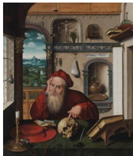
Title: Saint Jerome in his Study Date: c. 1530 Primary Maker: Joos van Cleve Medium: Tempera and oil on panel Object number: 1985.20 Credit Line: Purchase, Friends of the Vassar College Art Gallery Fund