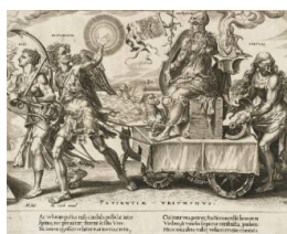
Title: The Triumph of Patience (No. 1 from the series) Date: Nd Primary Maker: Dirk Volkertsz Coorenhert Medium: Engraving Object number: 1978.6.1 Credit Line: Gift of Patricia Egan