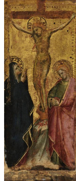
Title: Crucifixion Date: c. 1360 Primary Maker: Currently Unidentified Medium: Tempera on panel Object number: 1917.1.4 Credit Line: Gift of Charles M. Pratt