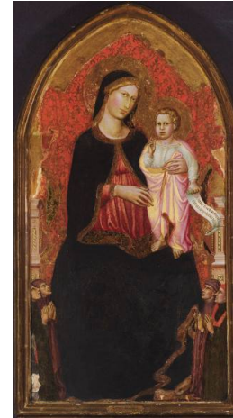
Title: Madonna and Child with Donors Date: c. 1408 Primary Maker: Martino di Bartolomeo Medium: Tempera with gold and punched decoration on Italian poplar wood panel, from an altarpiece Object number: 1917.1.8 Credit Line: Gift of Charles M. Pratt