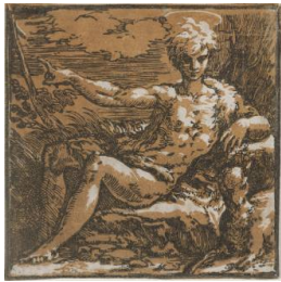
Title: St. John The Baptist in the Desert Date: Nd Primary Maker: Antonio da Trento Medium: Chiaroscuro woodcut from two blocks, printed in rust and black on cream laid paper Object number: 1984.19 Credit Line: Museum purchase