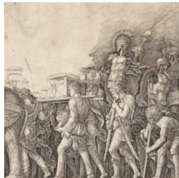
Title: The Corselet Bearers (from The Triumphs of Caesar by Andrea Mantegna) Date: c. 1498 Primary Maker: Giulio (?) Campagnola Medium: Engraving Object number: 1972.37 Credit Line: Purchase, Louise Woodruff Johnston, class of 1922, Fund