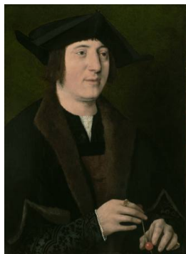
Title: Portrait of a Man Date: c. 1520-1535 Primary Maker: Joos van Cleve Medium: Oil on panel Object number: 1967.1.1 Credit Line: Anonymous gift