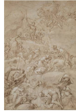
Title: Moses Striking the Rock Date: n.d. Primary Maker: Antonio Zanchi Medium: Pen and brown ink and wash with white heightening over traces of black chalk on cream prepared paper Object number: 2000.5 Credit Line: Purchase, Friends of the Frances Lehman Loeb Art Center Fund