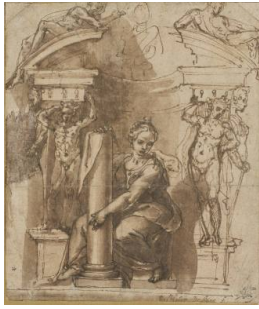
Title: Fortitude Date: c. 1570 Primary Maker: Raffaellino da Reggio Medium: Pen and sepia wash over black chalk heightened with white on paper Object number: 1938.8 Credit Line: Museum purchase