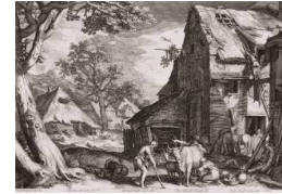
Title: The Prodigal Son Reduced to a Swineherd Date: Nd Primary Maker: Jan Saenredam Medium: Engraving on paper Object number: 1984.20 Credit Line: Museum purchase