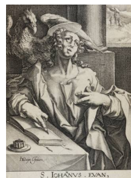
Title: The Four Evangelists: St. John Date: Nd Primary Maker: Jacques de, II Gheyn Medium: Engraving Object number: 1972.4.d Credit Line: Purchase, Adolf Katzenellenbogen Memorial Fund