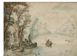
Title: View of a Canal in a Village Date: Nd Primary Maker: Jan Brueghel, the elder Medium: Sepia and blue ink and wash on paper Object number: 1940.6 Credit Line: Purchase, Art Majors Fund