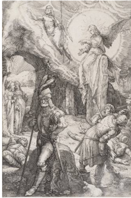
Title: The Resurrection Date: 1596 Primary Maker: Hendrick Goltzius Medium: Engraving Object number: 1969.21 Credit Line: Purchase, Adolf Katzenellenbogen Memorial Fund