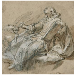
Title: Saint John, the Evangelist Date: Nd Primary Maker: Abraham Bloemaert Medium: Brown ink with grey wash over black chalk, heightened with white on paper Object number: 1969.22 Credit Line: Purchase, Adolf Katzenellenbogen Memorial Fund