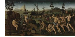
Title: The Adventures of Ulysses: The Battle with the Laestrygonians Date: Nd Primary Maker: The Master of the Johnson Assumption of the Magdalen Medium: Tempera on panel Object number: 1917.1.3.b Credit Line: Gift of Charles M. Pratt