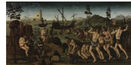
Title: The Adventures of Ulysses: The Battle with the Laestrygonians Date: Nd Primary Maker: The Master of the Johnson Assumption of the Magdalen Medium: Tempera on panel Object number: 1917.1.3.b Credit Line: Gift of Charles M. Pratt