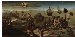
Title: The Adventures of Ulysses: The Blinding of Polyphemus Date: Early 1500s Primary Maker: The Master of the Johnson Assumption of the Magdalen Medium: Tempera on panel Object number: 1917.1.3.a Credit Line: Gift of Charles M. Pratt