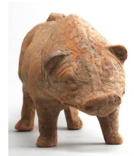
Title: Pig Date: Nd