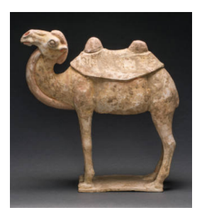
Title: Large Bactrian Camel Date: Nd Primary Maker: Chinese

Medium: Pottery with traces of red, black and