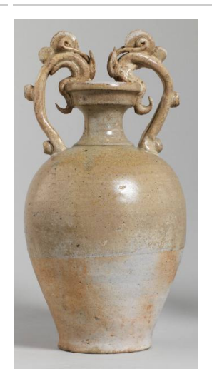
Title: Amphora shaped vase with two dragon handles Date: Nd Primary Maker: Chinese Medium: Ceramic: glazed white stone ware

Object number: 1944.4.11 Credit Line: The Olga Hasbrouck, class of 1905,