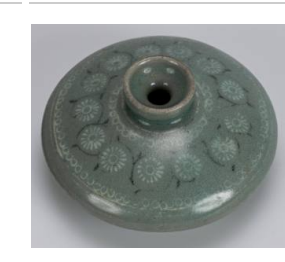
Title: Bottle Date: Nd

Primary Maker: Korean Medium: Ceramic: whitish ware with greenish grey glaze and ornaments inlaid in white and black clay Object number: 1936.5.66 Credit Line: Gift of Charles