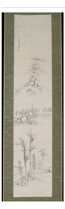
Title: Late Fall Landscape (after Ni Zan) Date: 1834 Primary Maker: Nakabayashi Chikuto Medium: Ink on paper Object number: 2004.5.2 Credit Line: Purchase, Friends of the Frances Lehman Loeb Art Center 25th Anniversary Fund