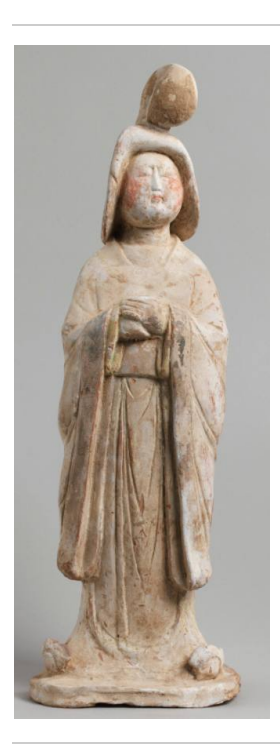
Title: Court Lady Date: c. 618-906 Primary Maker: Chinese Medium: Ceramic: painted