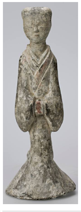
Title: Standing female attendant Date: 206 BCE-220 CE Primary Maker: Chinese

Medium: Grey earthenware with white slip and traces