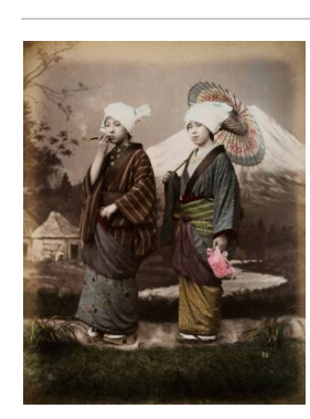
Title: Two Women before Painted Backdrop of Mount Fuji