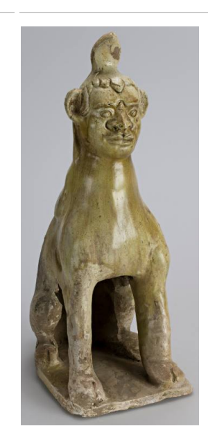
Title: Tomb Guardian