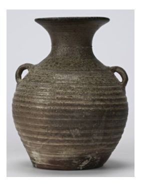
Title: Jar Date: 25-220

Primary Maker: Chinese Medium: Ceramic: glazed stone ware (dark brown glaze with ribbed design on