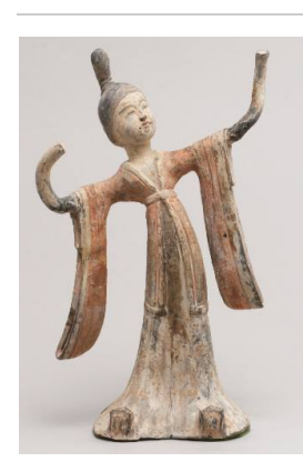
Title: Dancing girl Date: 7th c Primary Maker: Chinese Medium: Ceramic: pottery with traces of polychrome slip

Object number: 1944.3 Credit Line: Purchase. beguest of Vera Hamilton,