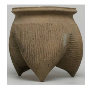
Title: Li vessel

Date: c. 1050 BCE Primary Maker: Chinese Medium: Ceramic: cord impressed earthenware Object number: 1943.2.26 Credit Line: The Olga